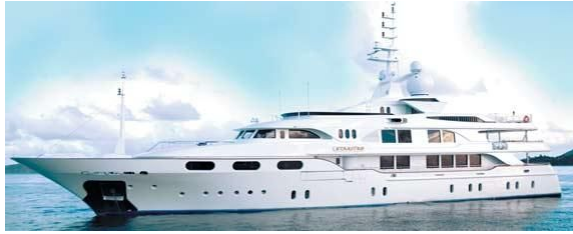
54m (178') Benetti 3 clean-exhaust systems installed 2 3306 Caterpillar generators 1 3304 Caterpillar generator

For more information info@clean-exhaust.com