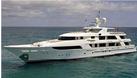
50m (154') Westport 3 clean-exhaust systems installed 2 99KW Northern Lights generators 1 65kW Northern Lights generator