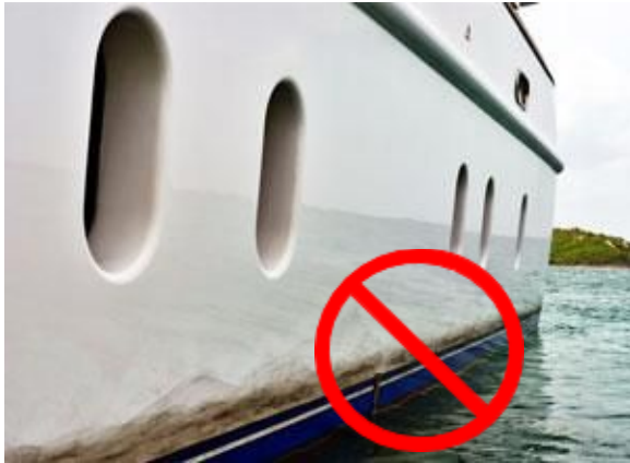
clean-exhaust soot reduction system